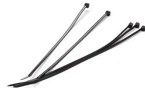
Five Cable Ties