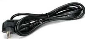
AC Power Cord