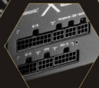
Patented DC connector Module