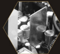
High Quality 105°C Cap